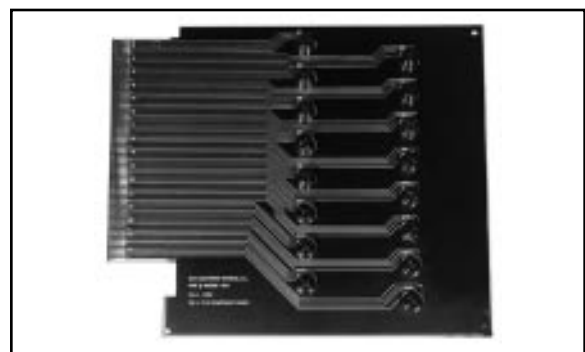
3-4 Lead Component Card

Devices under test may be selected automatically or individually by referring to the specific device number which is labeled for each socket on the device card. Thus, particular device(s) may be selected and measured independently if desired. Each device lead is provided with 2 electrically isolated traces and a Kelvin socket connection. Component card design and socket selection can be customized for the user's specific application. Sun Systems' will work with you to identify your testing needs and customize the switching matrix to your specifications.