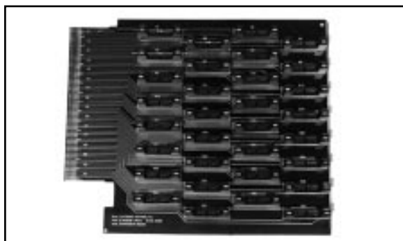
2 Lead Component Card